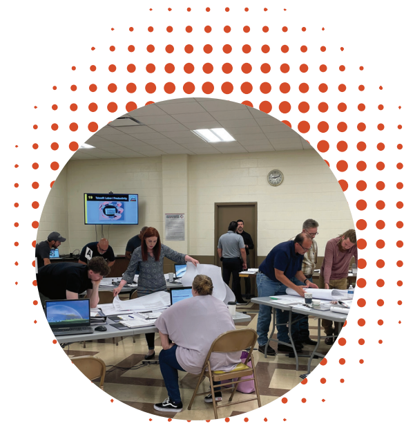
Fundamentals of Cost Estimating & Bidding class in Wheeling, W.Va.