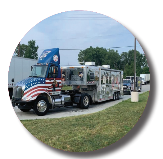
Truck Wrap at Iron Workers Local 25 (Detroit)