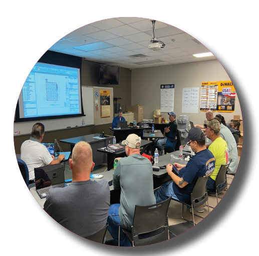
Cost Estimating and Bidding Class in Arlington, Texas