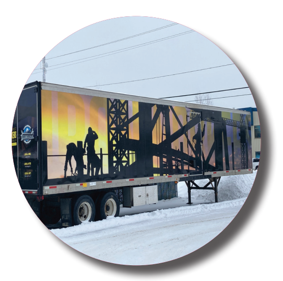
Weld trailer at Iron Workers Local 751 (Anchorage, Ala.)

Superintendent Training for Ironworkers – November Surrey, British Columbia