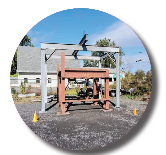
Iron Workers Local 440 (Utica, N.Y.) Training Mockup