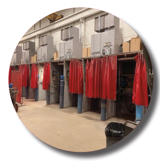
Welding Booths at Iron Workes Local 764 (St. John's, Newfoundland)