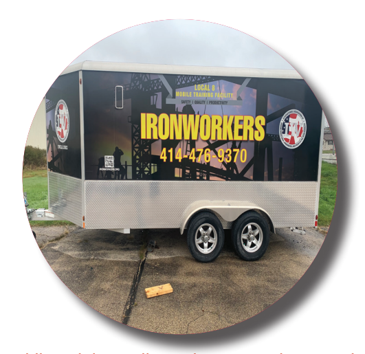
Mobile Training Trailer at the Iron Workers Local 8 Training Center (Neenah, Wis.)

Supervisor Training for Shop Ironworkers – June – LaPalma, Calif.