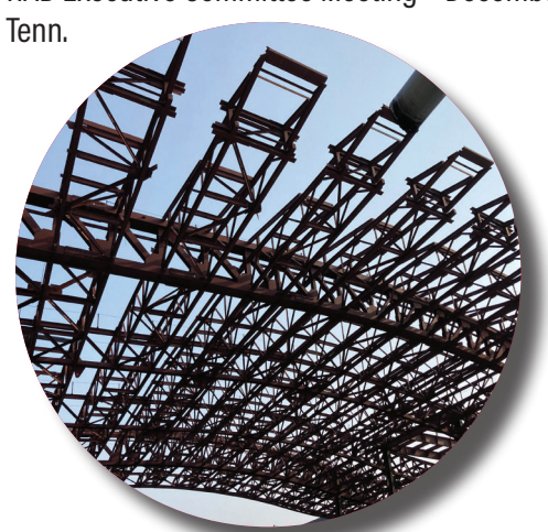
Nashville Airport in Nashville, Tenn.