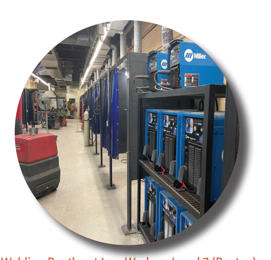
Welding Booths at Iron Workers Local 7 (Boston)